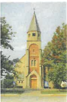
St. Stanislaus Wardville