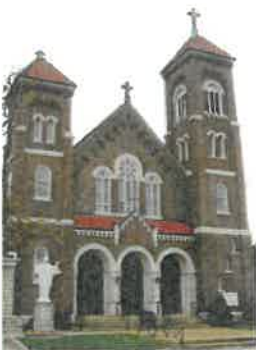
Immaculate Conception Jefferson City