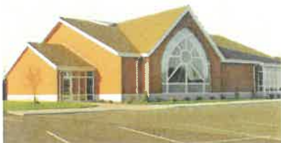
St. Andrew Holts Summit