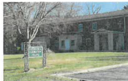
Cathedral of St. Joseph in Adoration Chapel Jefferson City