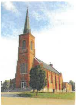
St. Francis Xavier Taos