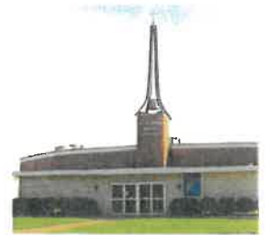
St. Martin St. Martins